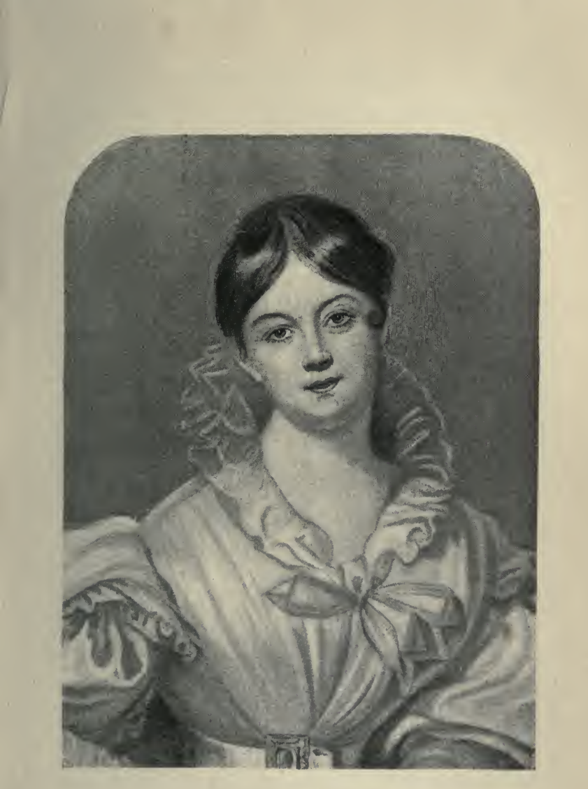
LETITIA E. LANDON. BORN AUGUST 14TH, 1802; DIED OCTOBER 15TH, 1838.