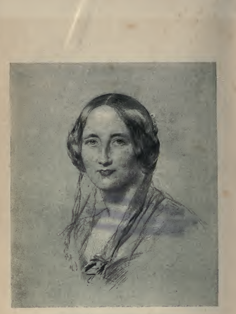
ELIZABETH CLEGHORN GASKELL.

Born 29th September, 1810; Died 12th November, 1865.